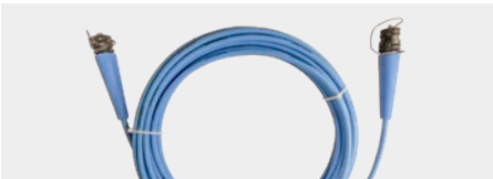
Control cable (25 m)