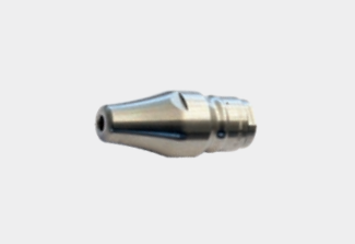
RD Mono (up to 2000 bar)

The water tool for pros. Thanks to its compact and leight-weight design, enduring, fatigue-free work is possible. The MASTERJET ensures a long service life thanks to the use of the patented HPS sealing system and robust components.