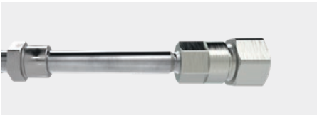
Fan jet nozzle (15°)