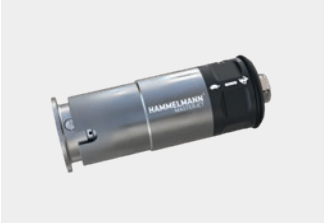
MASTERJET (up to 3200 bar)

The water tool for pros. Thanks to its compact and leight-weight design, enduring, fatigue-free work is possible. The MASTERJET ensures a long service life thanks to the use of the patented HPS sealing system and robust components.