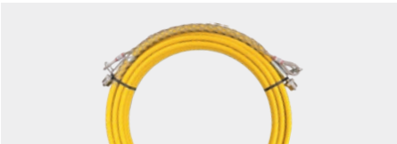
High-pressure hose (20 m)