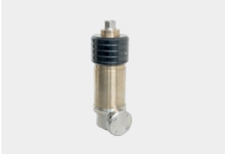
AQUAMAT S 600

The simple rotor nozzle treats surfaces with high precision precisely and reliability at an operating pressure of up to 2000 bar.