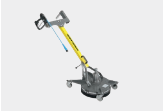
AQUABLAST® Basic E

The smallest of our AQUAMAT tank cleaning units impresses with its patented HPS technology, which is also used in our Masterjet rotor jets.