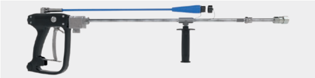
High-pressure spray gun SP 3000 E with electrical connector Hammelmann high-pressure spray guns are designed for demanding, industrial use. The ergonomically shaped handle and various extensions are easy to install.