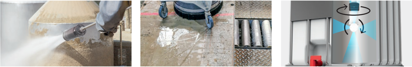
General gun blasting work Surface cleaning Vessel cleaning Industrial cleaning Cleaning of shuttering and scaffolding Cleaning of vehicles and construction machines Cleaning plaster molds and matrices