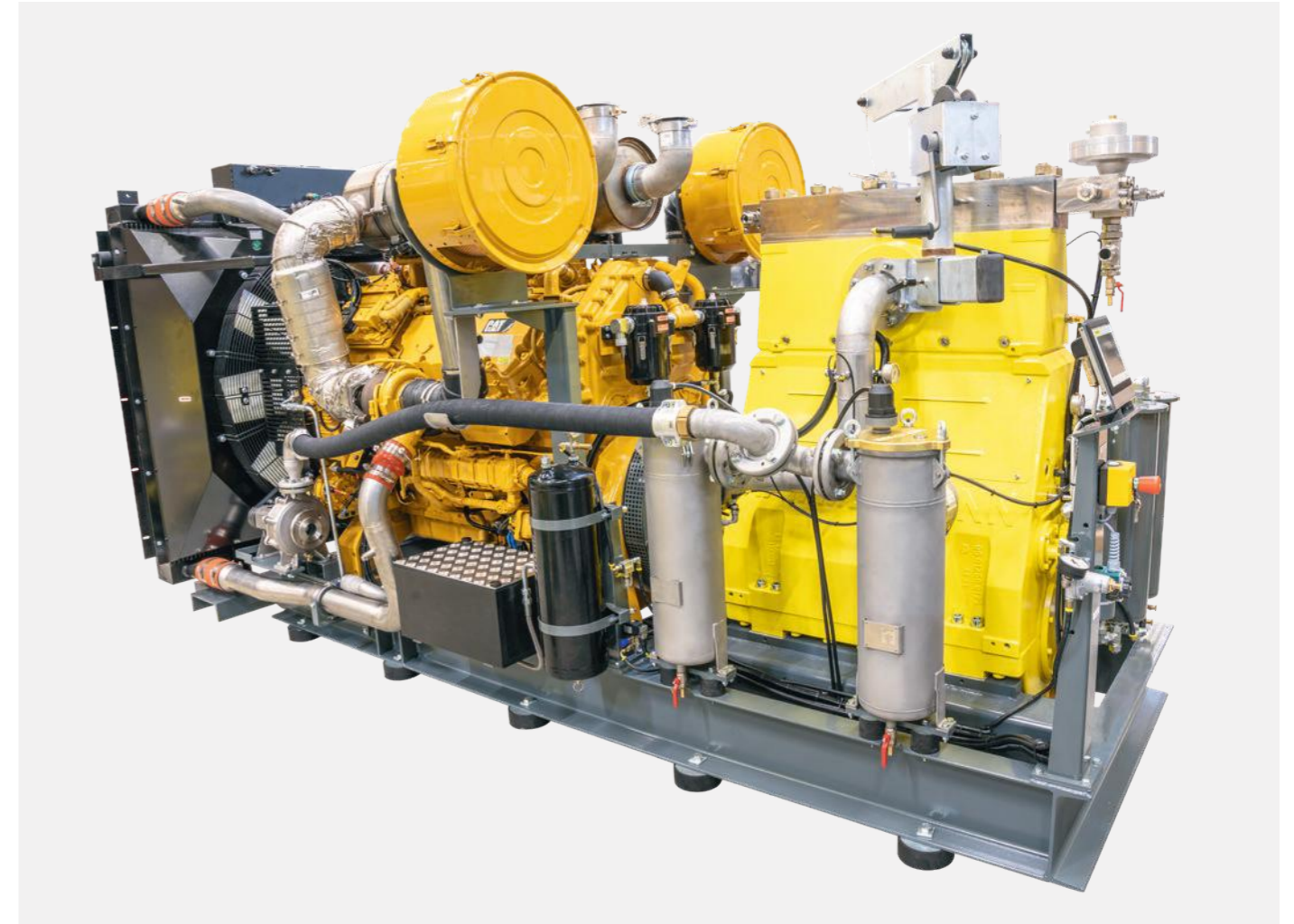
Stationary unit with diesel engine