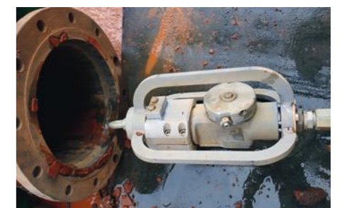
3D tank cleaning unit