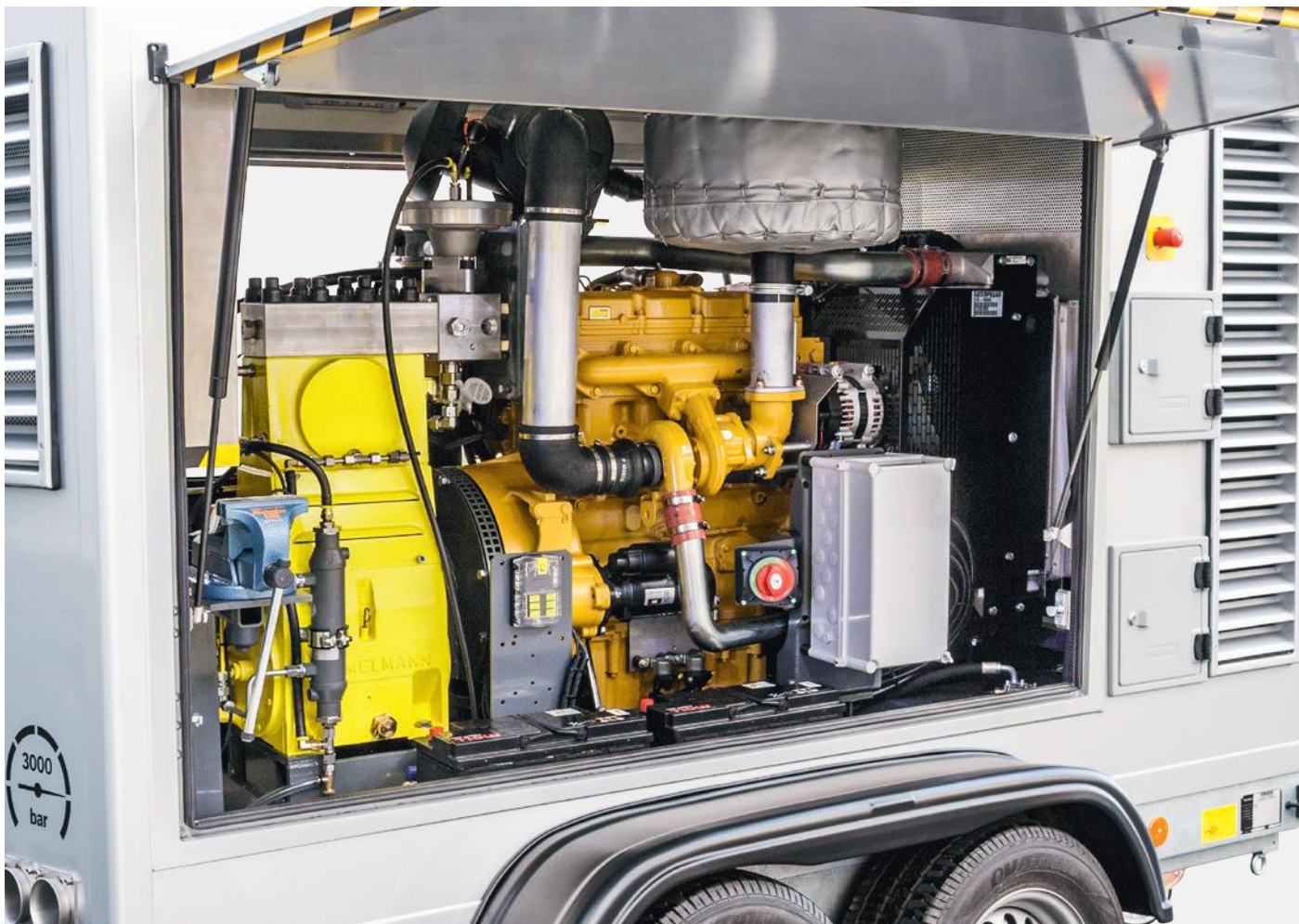
Mobile unit driven by diesel engine